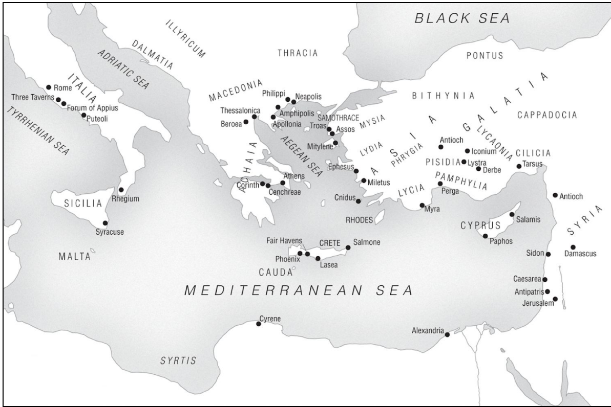
Ancient Map of the Mediterranean